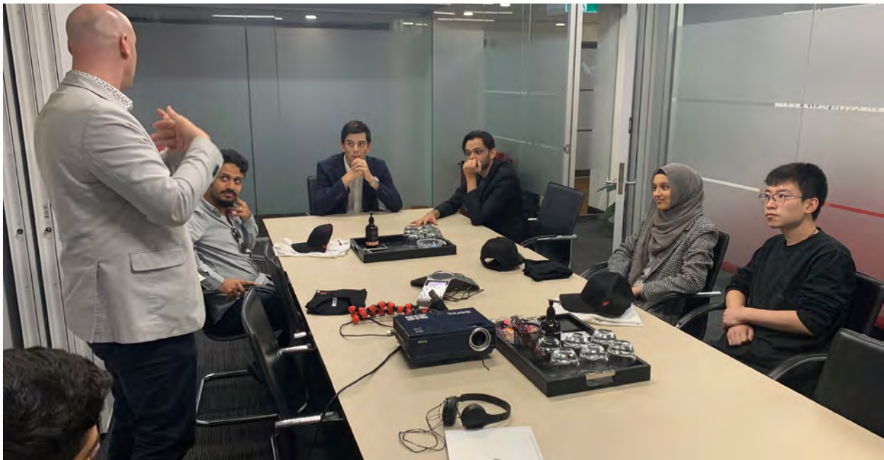
Students from RMIT having weekly meeting with the SILC team to discuss the progress of the project.

As recognition of the contributions at the end of each semester, the RMIT students are invited to visit The SILC Group offices and have a team celebratory lunch with the staff to commemorate the successful completion of the program. The SILC Group appreciates the contribution that the students have made and would like to build and develop a long-term relationship with RMIT and the students by providing industry references and employment advice. The company wishes to demonstrate its sense of social responsibility by helping the younger generation in job-seeking, particularly during these challenging times.