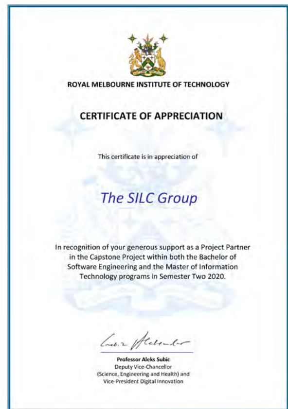
Certificate of Appreciation issued by RMIT.